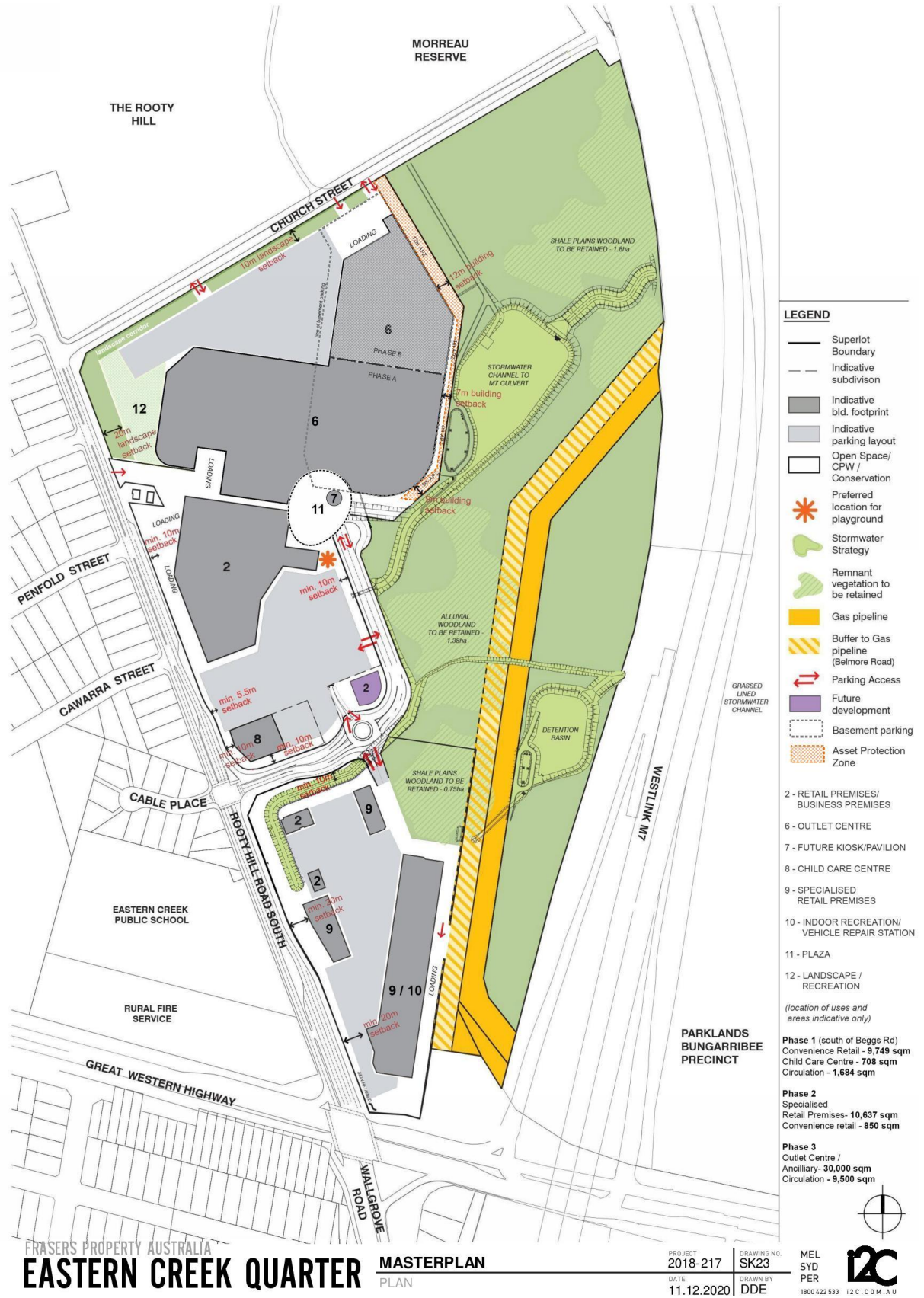
Figure 4: Revised location of the detention basins in the VMP area