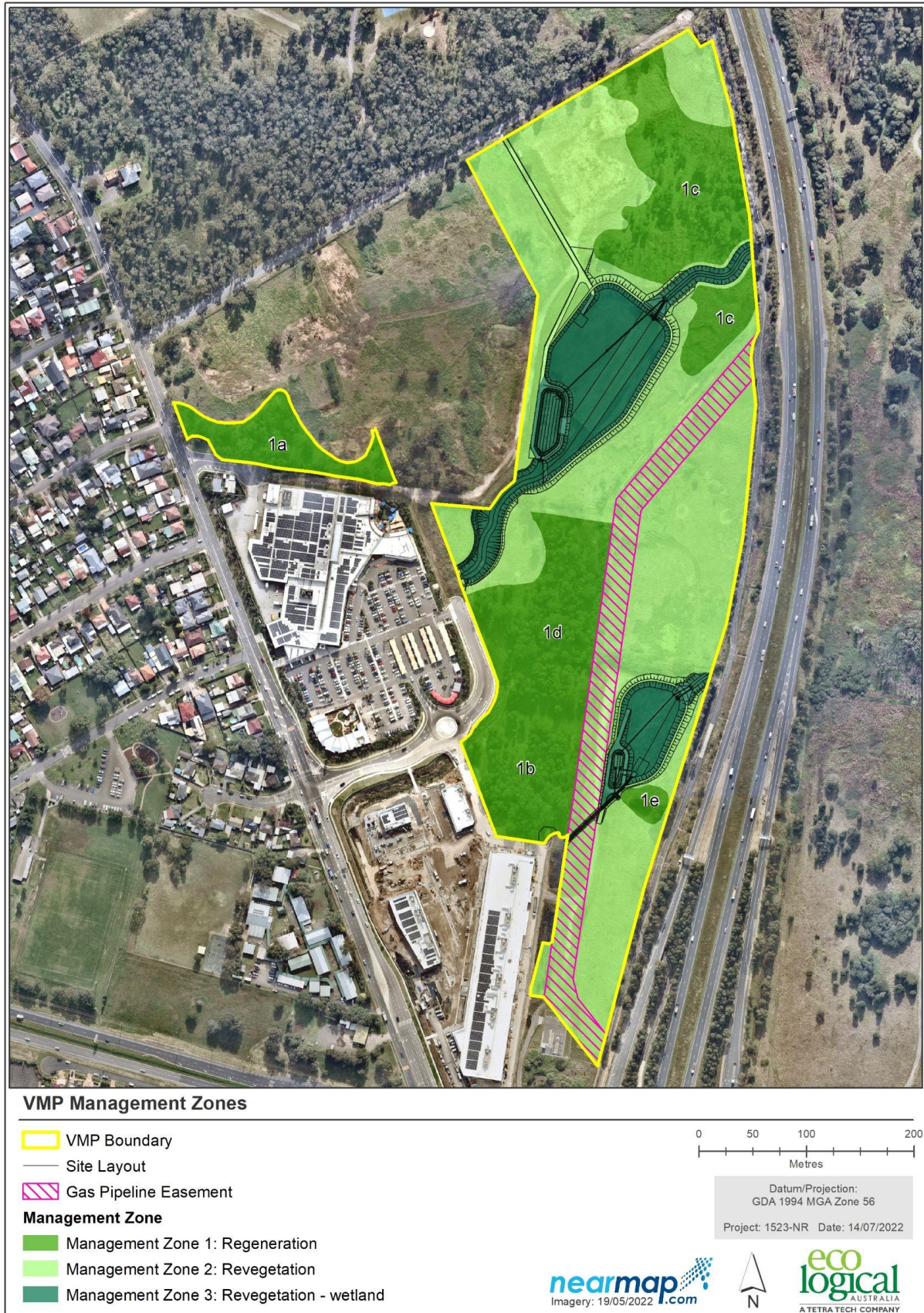
Figure 2: VMP map as depicted in Version 8 of the VMP (ELA 2022)